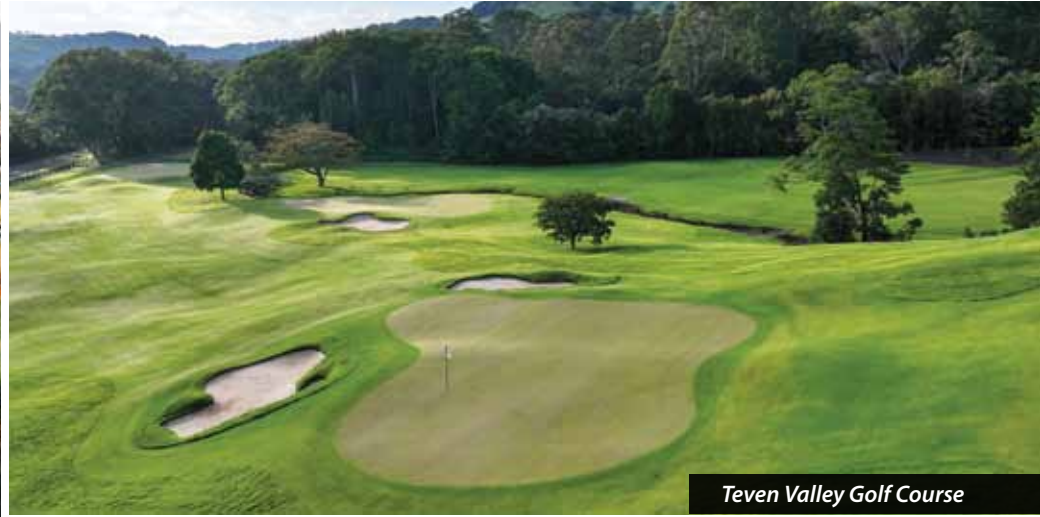
Teven Valley Golf Course

Murwillumbah Golf Club 233 Byangum Rd, Murwillumbah, NSW 2484 Phone: (02) 6672 1799 www.murwillumbahgolfclub.com.au