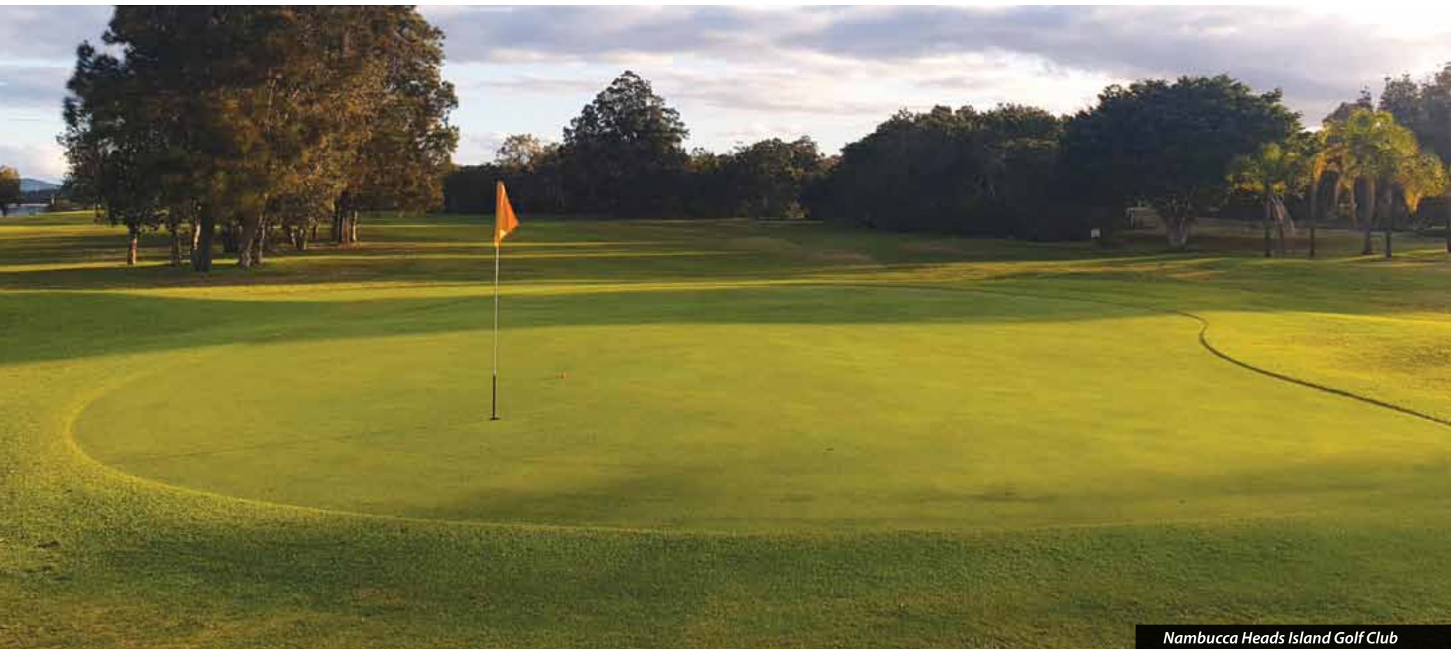
Nambucca Heads Island Golf Club