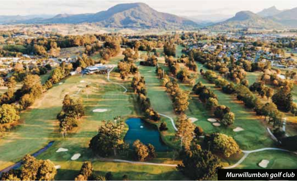
Murwillumbah golf club