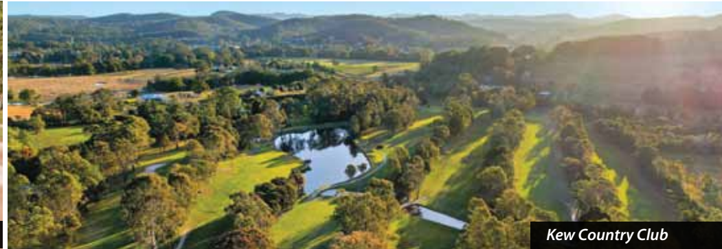
Kew Country Club

MORE INFORMATION: Ocean Shores Country Club Orana Road Ocean Shores NSW 2483 Phone: (02) 6680 1008 info@oceanshorescc.com.au