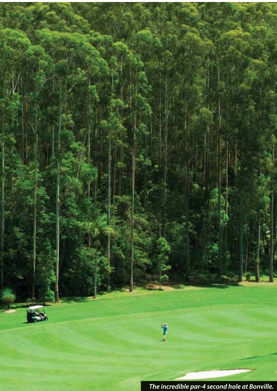
The incredible par-4 second hole at Bonville.