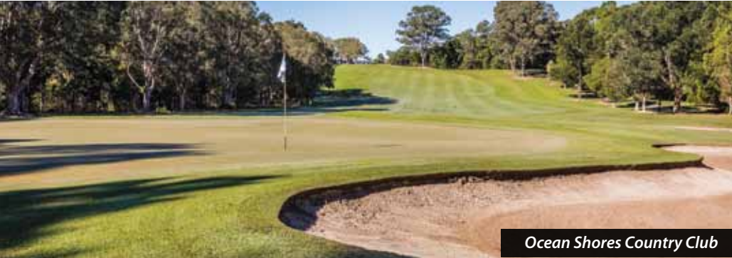
Ocean Shores Country Club