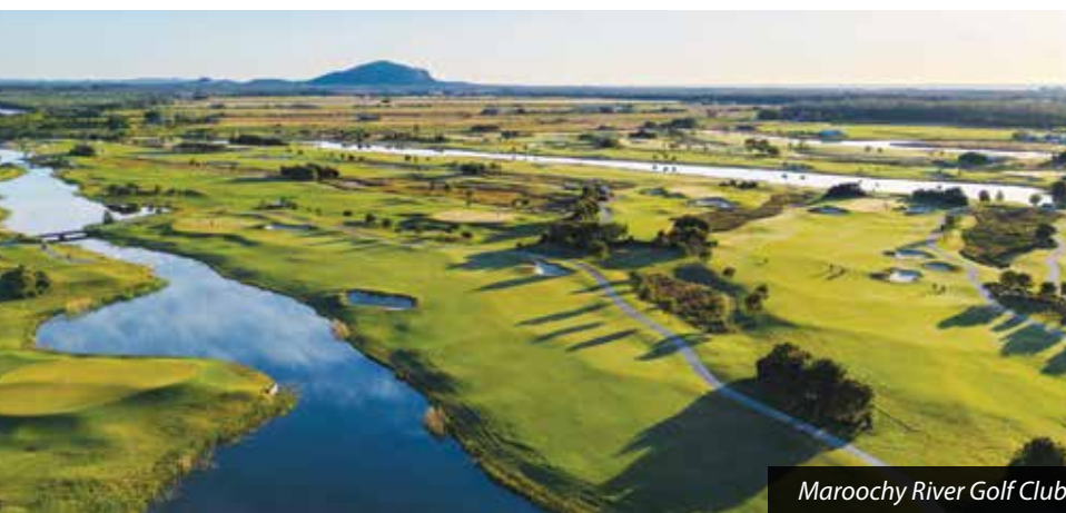
Maroochy River Golf Club

When Graham Marsh designed and built Maroochy River, he promised a gutsy (risk-and-reward) course, and he certainly