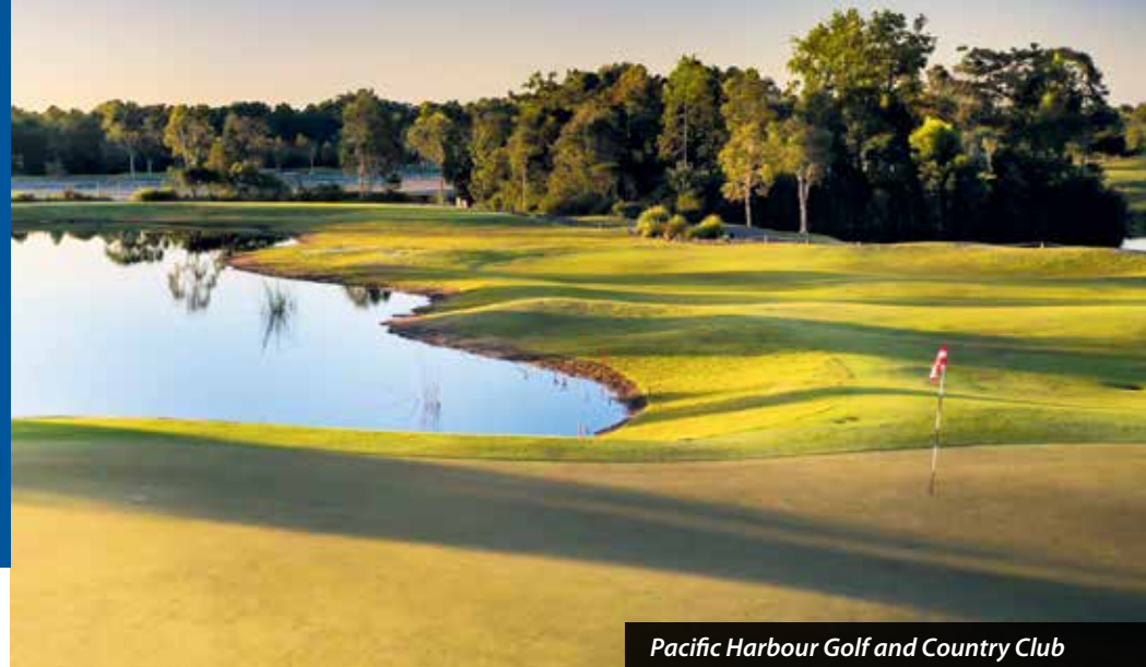
Pacific Harbour Golf and Country Club

Here are a few of our favourite Sunshine Coast gems.