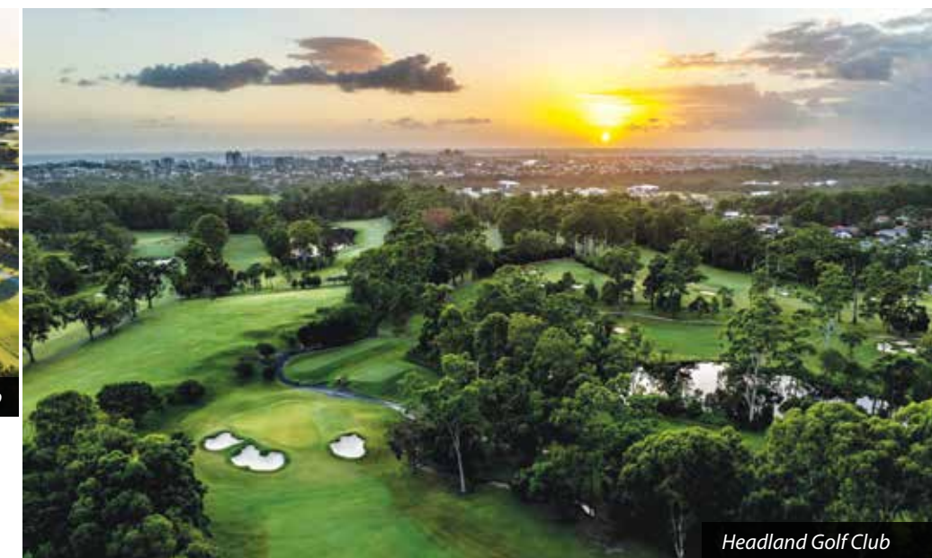
Headland Golf Club

MORE INFORMATION: Maroochy River Golf Club 374 David Low Way, Bli Bli, Sunshine Coast, Queensland Phone: (07) 5373 1000 Pro shop: (07) 5457 0900 www.maroochyrivergolfclub.com.au