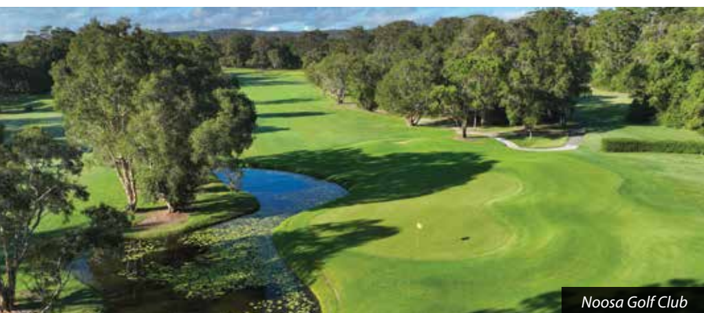
Noosa Golf Club