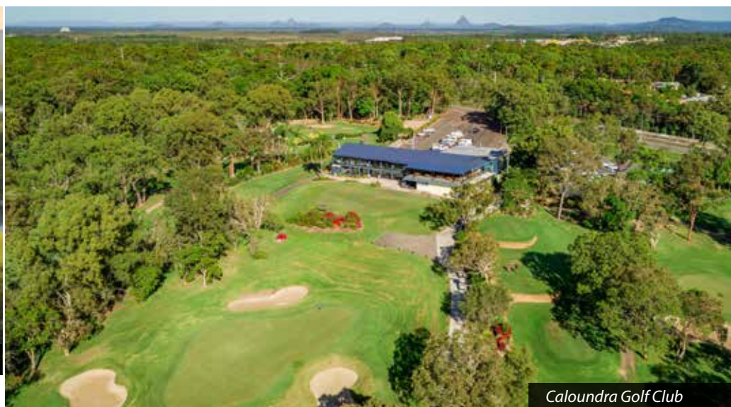
Caloundra Golf Club

MORE INFORMATION: Noosa Springs Golf & Spa Resort Phone: (07) 5440 3325 golf@noosaspings.com.au www.noosaspings.com.au