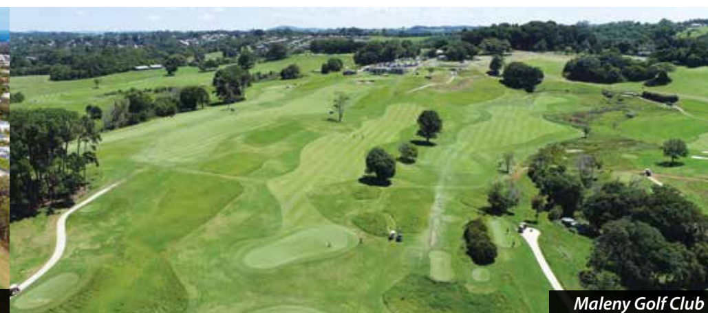
Maleny Golf Club

MORE INFORMATION: Peregian Springs Golf Club 95 Peregian Springs Dr, Peregian Springs QLD 4573 Phone (07) 5471-5400 proshop@peregianspringsgc.com.au www.peregiangolf.com