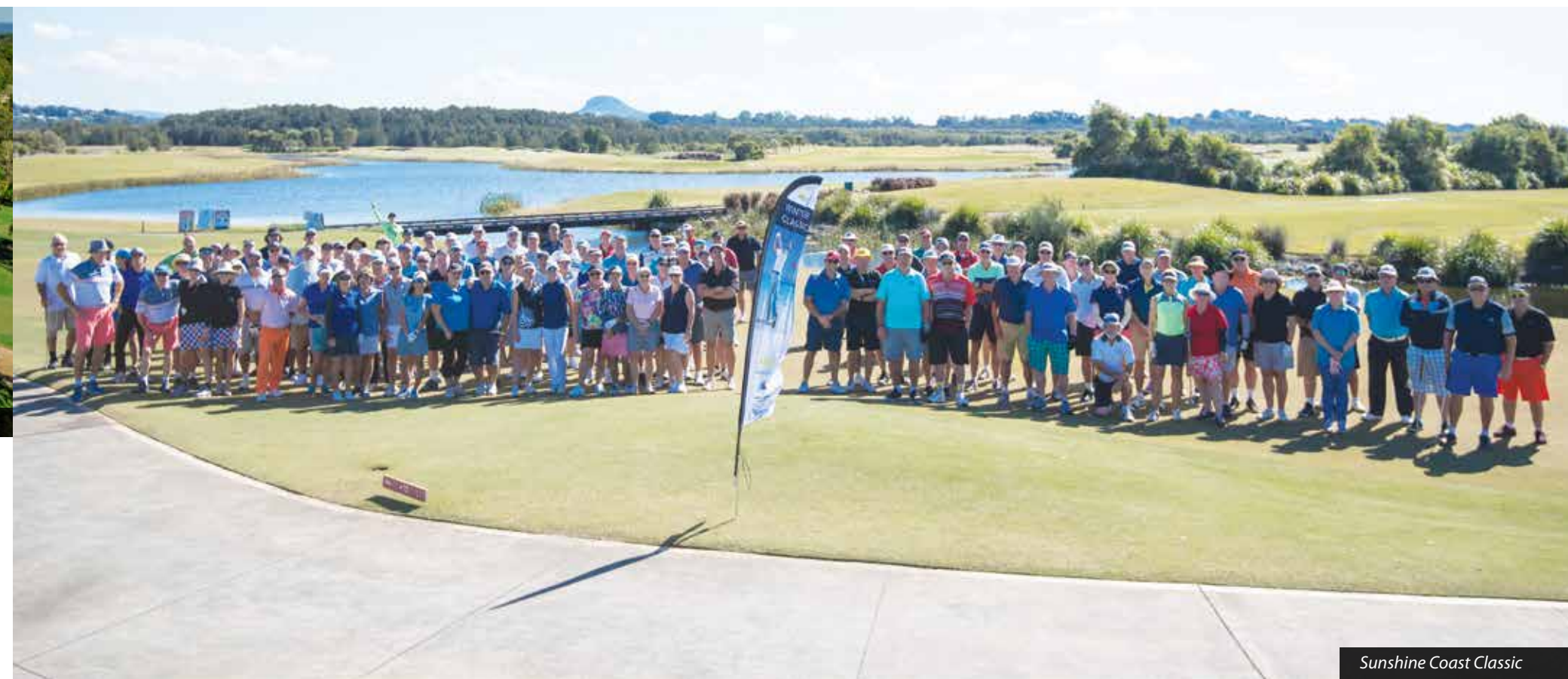
Sunshine Coast Classic

MORE INFORMATION: Caloundra Golf Club 1 Charles Woodward Dr, Caloundra, QLD 4551 Phone: (07) 5491 1811 www.caloundragolfclub.com