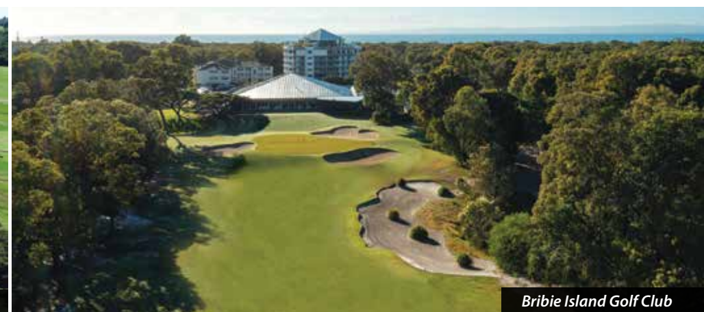
Bribie Island Golf Club

The course has been built to a high standard under the direction of course