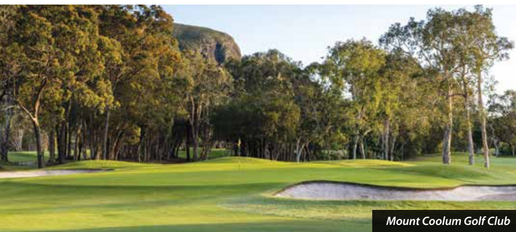
Mount Coolum Golf Club