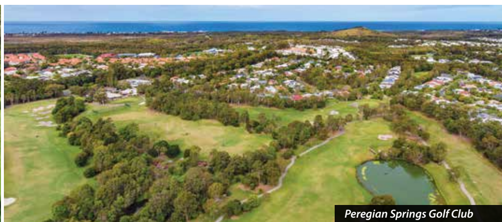
Peregian Springs Golf Club

The club is also famous for being genuinely welcoming to all visitors, whether they be golfers or not. The clubhouse is a popular community meeting place and preferred venue for a chilled evening out. Its Bistro offers lunch specials every weekday, dinner from Wednesday to Friday, and its trivia nights, on the first Wednesday of each month, are almost always booked out. There's a happy hour each day from 4pm, with a high-quality open bar and outstanding modern gaming and entertainment facilities, offering plenty to do for non-golfing visitors, families and locals.