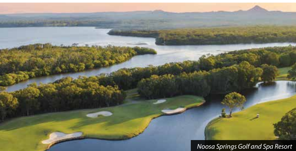
Noosa Springs Golf and Spa Resort