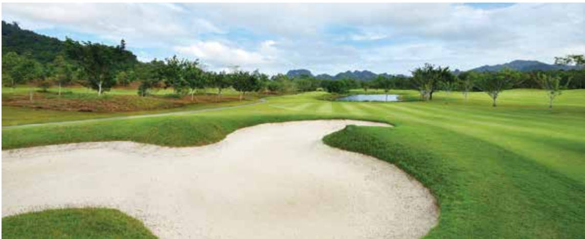
■ Gunung Raya Golf course

COMPRISING a group of 99 tropical islands lying off the north-western coast of Peninsular Malaysia, Langkawi is a natural paradise, boasting clear emerald waters, forested hills and white-sandy beaches, providing visitors with a host of water sports and other recreational activities.