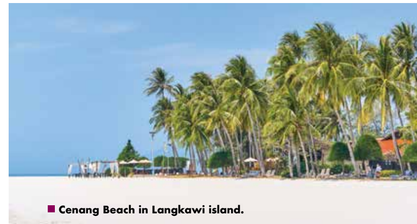
■ Cenang Beach in Langkawi island.

A wide variety of accommodations are available in different areas of Langkawi, with modern deluxe hotels and resorts, all offering excellent dining and recreation experiences and located in close proximity to the Gunung Raya course. The Langkawi International Airport is approximately 20 mins traveling time by road, the Kuah Jetty and Kuah Town 10-15 mins, Tanjung Rhu, Mukim Ulu Melaka, 20-30 mins and the Pantai Cenang, Pantai Tengah and Pantai Kok areas and The Datai & The Andaman, a drive of 35 – 45 mins.