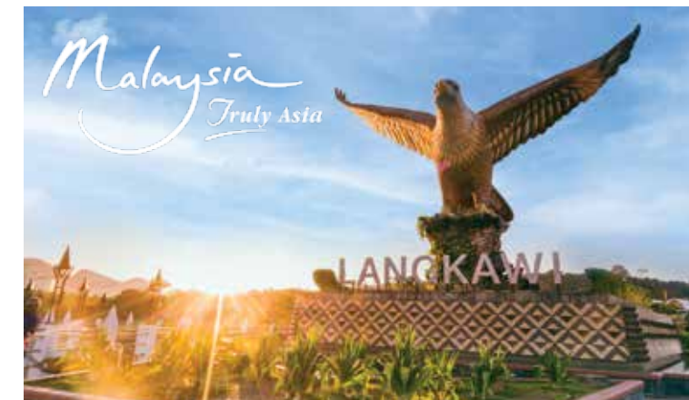
■ The iconic Eagle Statue in Eagle Square.

The first Geopark in the south-east Asian region, the Kilim Geopark is 100 square kilometres of nature reserve and breathtaking landscape.